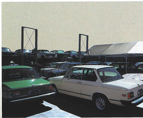
Left: 2002AD, one of the world's largest stockers of spare parts for the BMW 2002, is located in Sun Valley, near Los Angeles. Below: Bumpers patiently awaiting a new life in a restored classic

Do you have a family jewel – a BMW 2002, a CS Coupe or a Bavaria – laid-up in your garage because it needs parts? There's a place where you can find everything from brake calipers to special steering wheels: 2002AD.